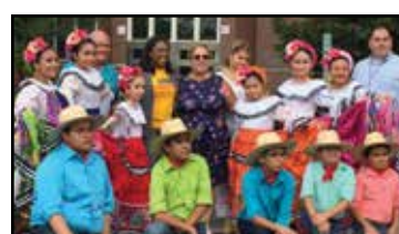
CPS Back-to-School Bash