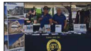
Taste of Polonia Fest