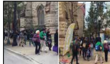
Chicago CROP Hunger Walk

The credit union held financial seminars on a variety of topics including: first time home buying, understanding credit, tax planning, retirement strategies and cash management. Our goal is to inspire financial wellness among our members and the communities we serve.