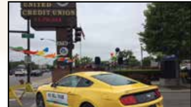
Annual Enterprise Car Sale