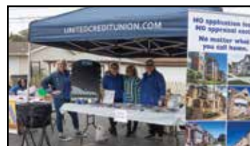
St. Bruno Blocktober Fest