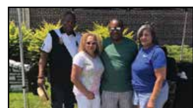
CPS Back-to-School Bash